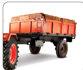
1.5 ton trolley

Suitable for sugarcane, cotton and groundnut