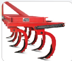
5 tine cultivator

Suitable for these applications and equipment