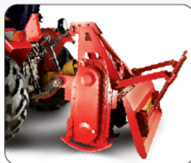
0.8 m rotavator