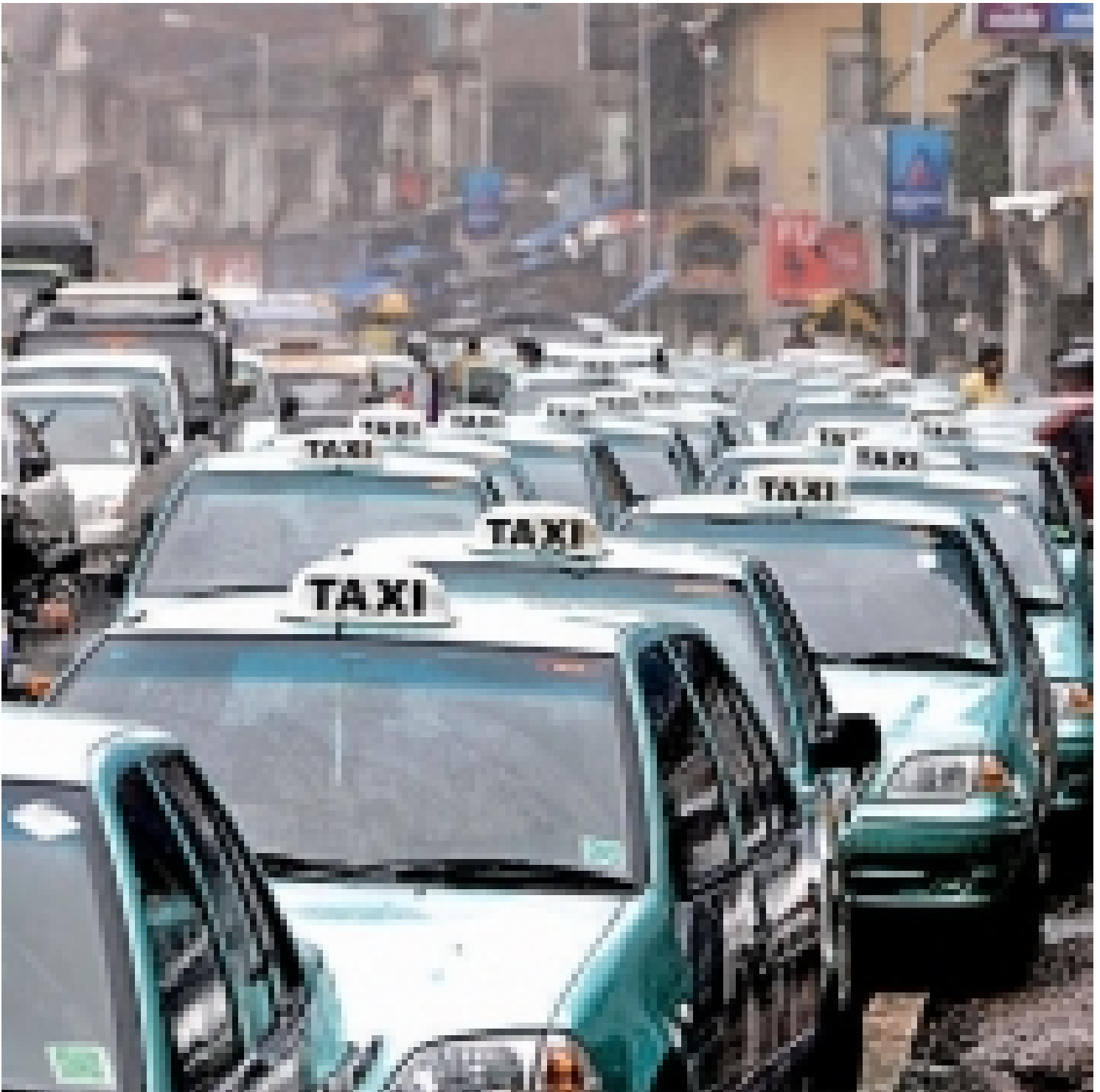
All taxis in NCR should convert to CNG by March 31: Supreme Court