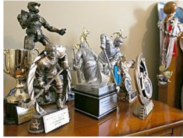
Downsizing? Ditch These 12 Items