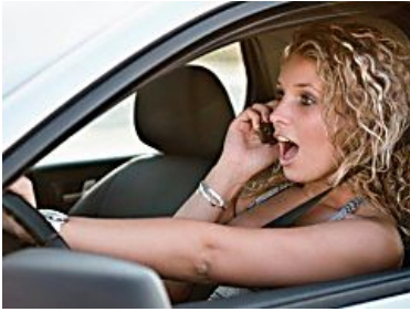
Top 5 Most Reliable Cars EVER - You'll Never Believe #4!