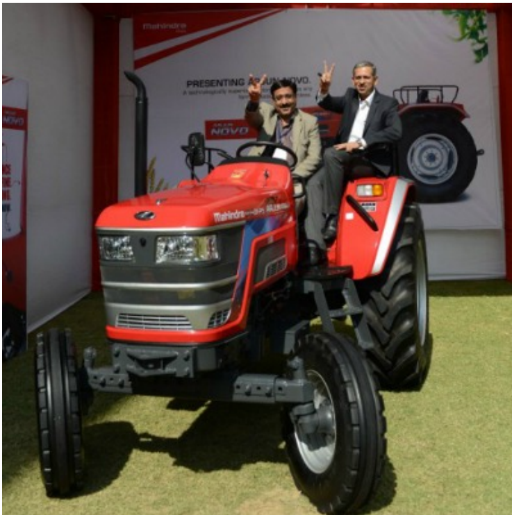
Mahindra Tractor Agencies

Under the Mahindra range of tractors, M&M sells models such as Yuvraj, Arjun, Bhoomiputra, Sarpanch and Shaan at a horse power range of 15 HP to over 50 HP.