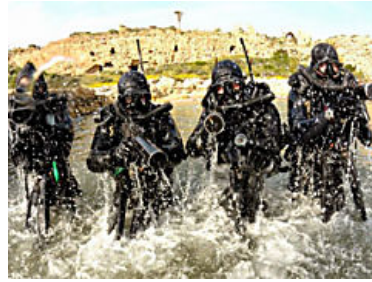
23 Most Intimidating Armed Forces Images Ever Seen